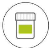
JAR 250g & 500g