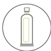
SYRINGE 10CC & 30CC