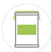
200 L DRUM

Please verify the packaging details, including volume and availability, with your sales representative, as they may vary depending on the production facility where the product is manufactured.