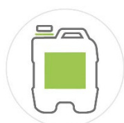
20 L CANISTER