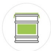
30 Kg DRUM